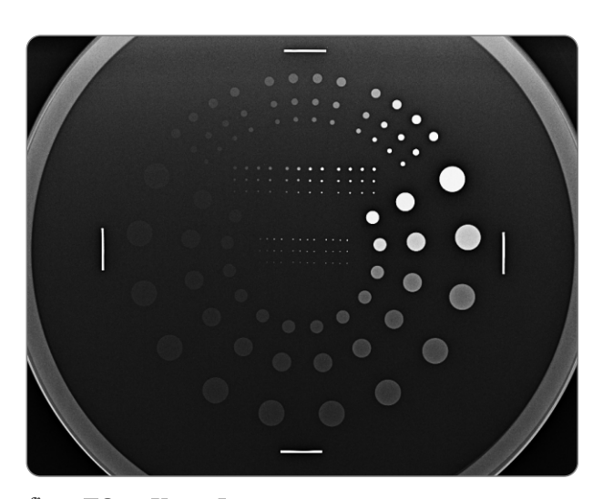
fig. 1 TO20 X-ray Image