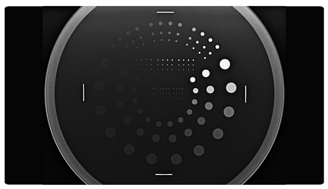
fig. 2 TO20 X-ray image