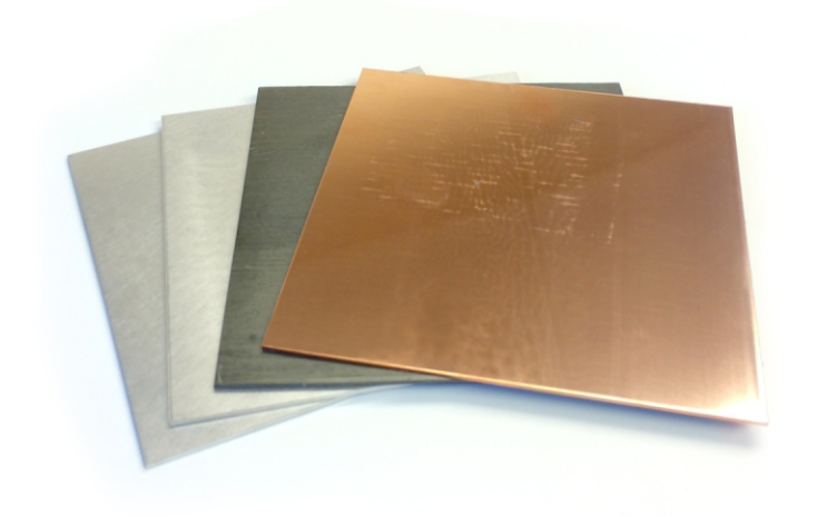
fig. 2 TO CDRH filters

Copper, Lead and Aluminium filters to be used with TO CDRH Phantom.