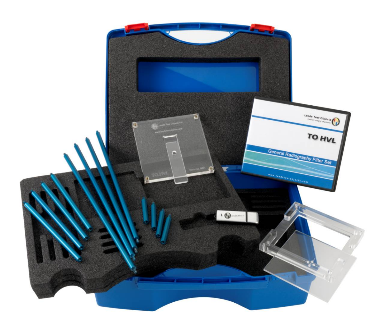
fig. 1 TO HVL set